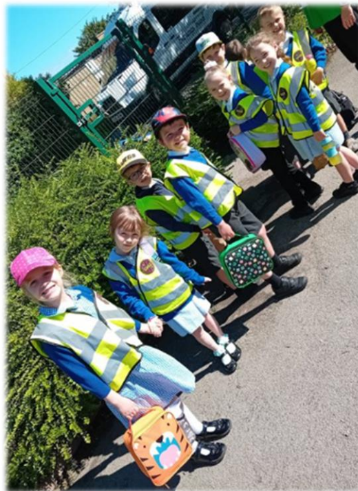
Year One setting off for this year's Wisbech Reads Festival