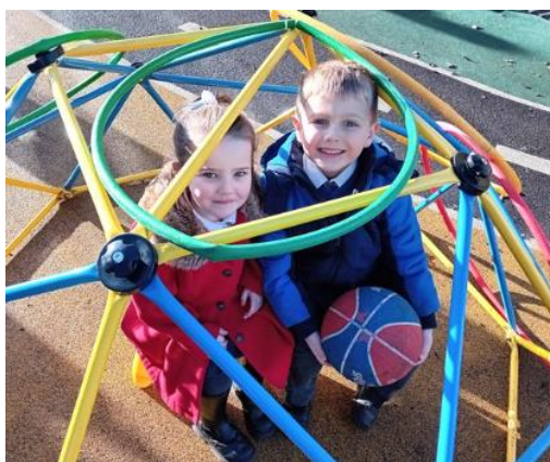
EYFS Outdoor learning, Spring Term 2024