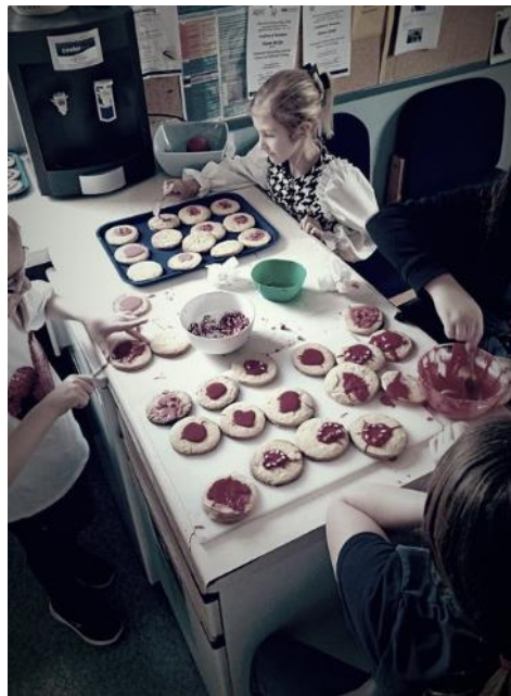
School Council busy on Red Nose day, 2024