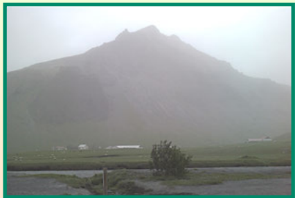
The sky turned black, ash and floods were everywhere.