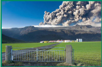
This is my farm with the ash cloud in the background.