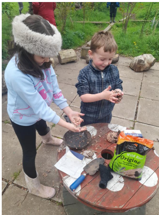
Robins Forest School