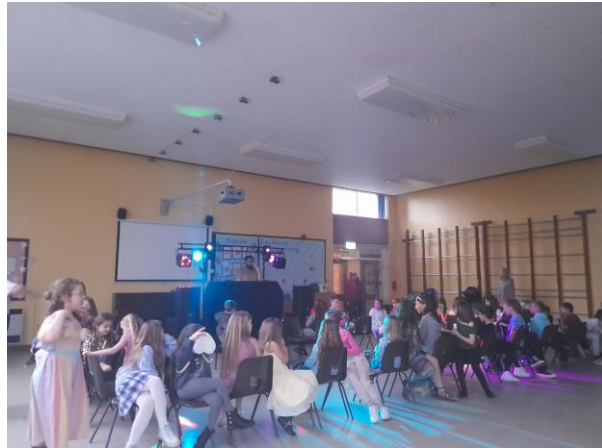
PTA Easter Disco