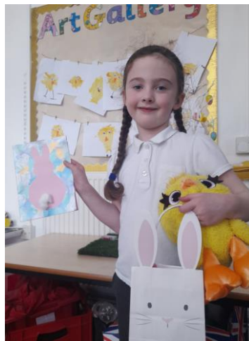
Easter Crafts by Liara