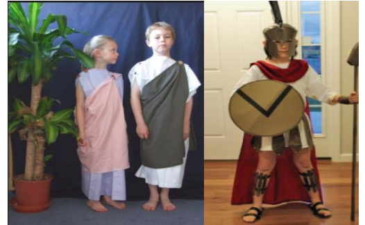
Possible costume ideas

Class 3 and 4 will be participating in a Greek Theme Day to celebrate the learning that has occurred as part of their Greek Topic. The day will have a rota of activities including Greek dancing, drama, crafts and much more. To make the day memorable, we ask if you could support your child by sending them to school in costume (although this is not essential). On the day, we would love you to join us from 2:30 pm so the children can share their learning journey with you.